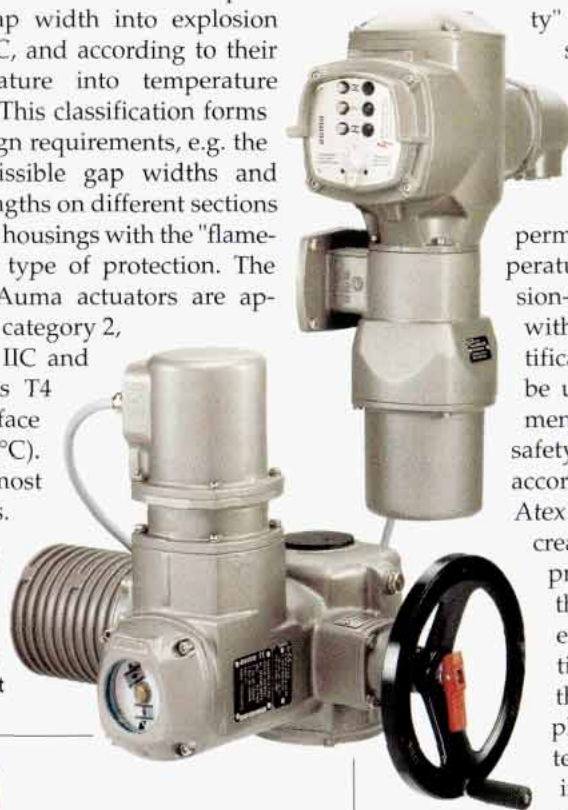
Fig. 1 SAExC 07.5 electric multi-turn actuator with Auma Matic AMExC actuator control on wall bracket

There are a number of possibilities when it comes to designing electrical equipment for use in potentially explosive atmospheres. The "flameproof enclosure" and "increased safety" types of protection are of major importance for actuators. The "flameproof enclosure" type of protection permits an explosion inside the electrical equipment. The joints between the housing parts are however designed in such a way that a flame or flammable particles cannot reach the outside. This is achieved by adequate sizing of the gap widths and lengths on the different sections of the housing. The housing has a rigid design, so that it can withstand the pressure which develops during an internal explosion without damage.