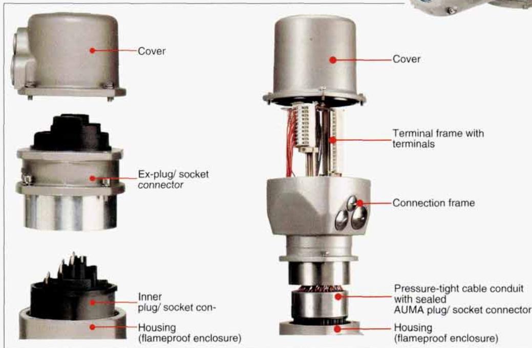
Fig. 2 Plug connector/terminal board with screw-type terminals (left), plug-in terminal connection with cage clamps (right)

For the "increased safety" type of protection, suitable measures have to be taken to prevent the formation of ignition sparks, electric arcs or impermissibly high temperatures. Only explosion-proof components with their own test certificate are allowed to be used in a compartment with increased safety. For actuators in accordance with the Atex directive, the "increased safety" type of protection applies to the area around the electrical connection. The terminals themselves are explosion-proof. All terminals are sized in such a way that no impermissibly hot surfaces or sparks can occur.